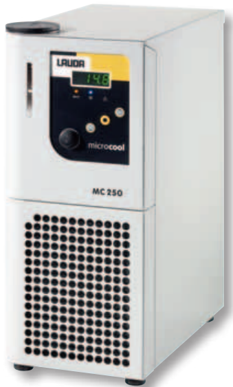
Circulation chiller MC 250

The compact design MC 250 model makes it ideal for being positioned on the benchtop. The circulation chiller is equipped with a magnetic coupling pump. This supplies a pump pressure of 0.35 bar and a maximum pump flow of 16 L/min.