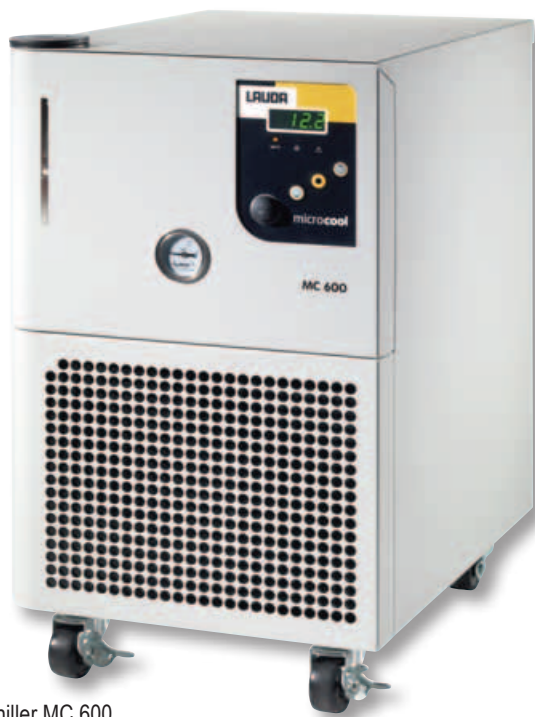
Circulation chiller MC 600

The 600 and 1200 Watt cooling capacity models are floor standing instruments designed to fit underneath the lab bench. They are equipped with a pressure gauge to display the pressure and casters which can be controlled and locked. Pump pressure can be controlled via the integrated bypass. At 1200 Watt, the most powerful device is also available in a water-cooled version as the MC 1200 W.