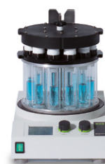
Multivapor™ P-6 / P-12 Efficient evaporation for multiple samples