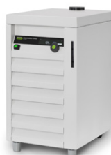
Recirculating Chiller F-305 / F-308 / F-314 The efficient and water saving way of cooling